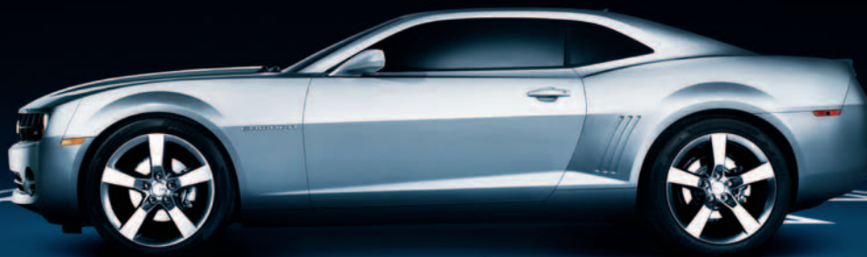
Camaro 1LT in Silver Ice Metallic. Shown with available RS Package and polished-aluminum wheels.

Some standard content may be deleted with fleet orders. See dealer for details.